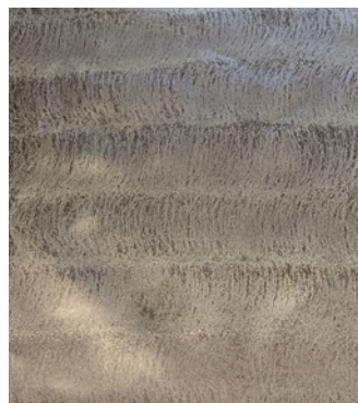
Proper Coverage on Membrane