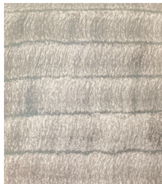
Proper Coverage on Insulation